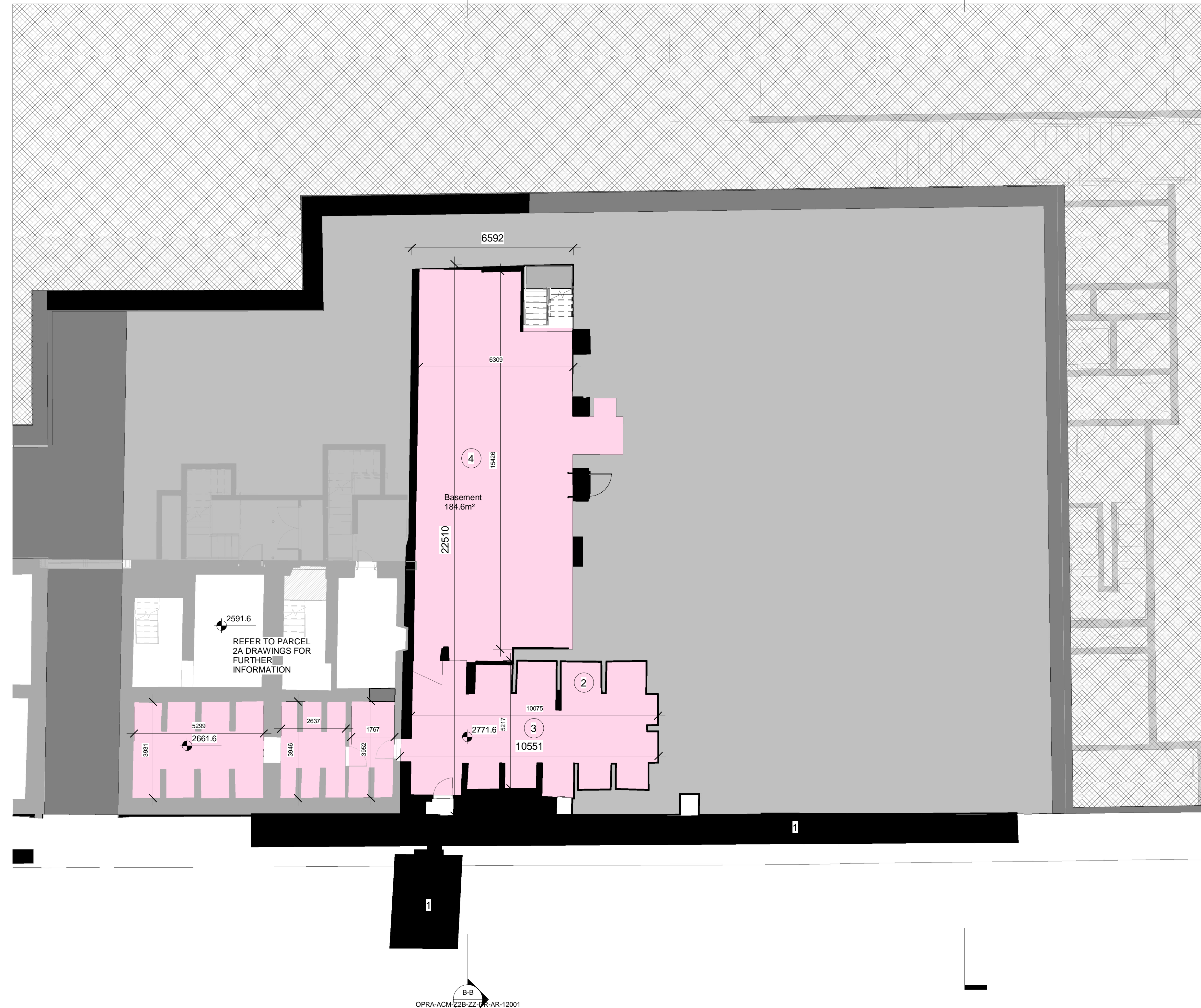
1 Proposed Basement Floor Plan SCALE: 1 : 100